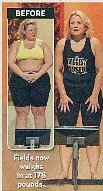
Fields now weighs in at 178 pounds.