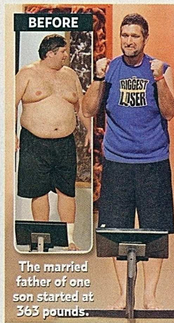
The married father of one son started at 363 pounds.